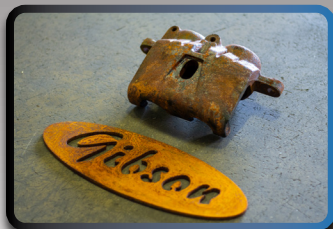
Part Surface Before & After Processing!