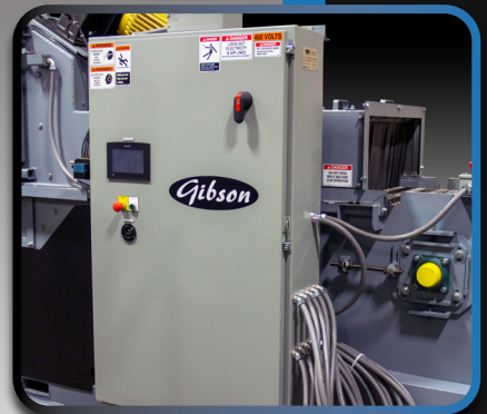
Includes HMI Controls For Automatic Timing!