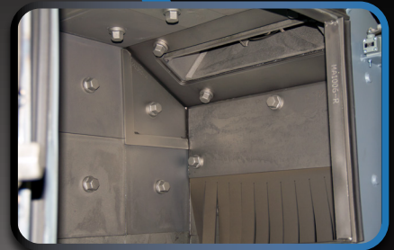
Abrasion-Resistant Cabinet Liners For Extended Service Life!