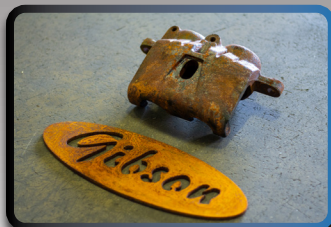
Part Surface Before & After Processing!