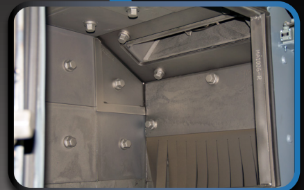
Abrasion-Resistant Cabinet Liners For Extended Service Life!