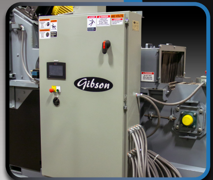
Includes HMI Controls For Automatic Timing!